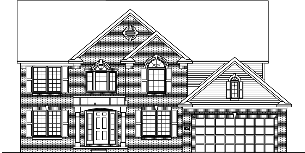
A - ELEVATION - STANDARD (Included in base price)