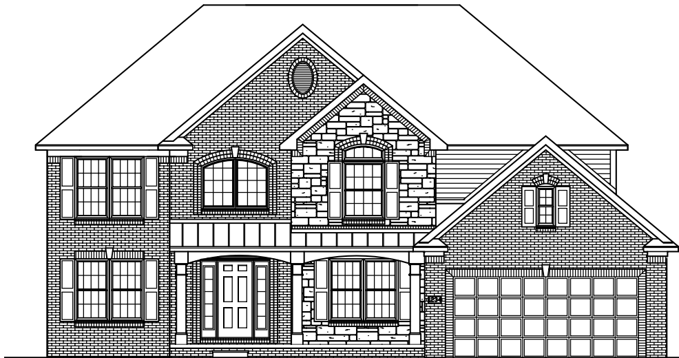
B - ELEVATION